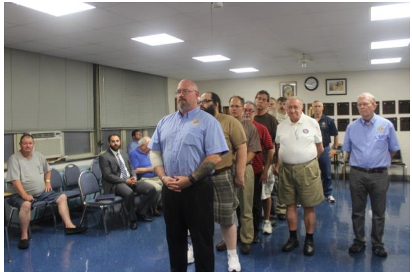
2017 Installation of Officers

Our next work party will be the 26th of August. We will work on cleaning the kitchen to make ready for the Kitchen Crew and another series of their excellent dinners..