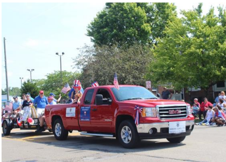
Council 3724 Float