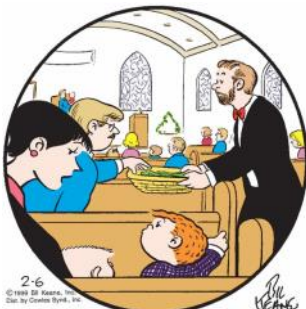
"He's not a beggar. He's collecting money for the church."

The first of our eight parish dinners will be held after the 4 pm Mass on September 8, 2018. Watch for more details in the Next issue of the Santa Maria.