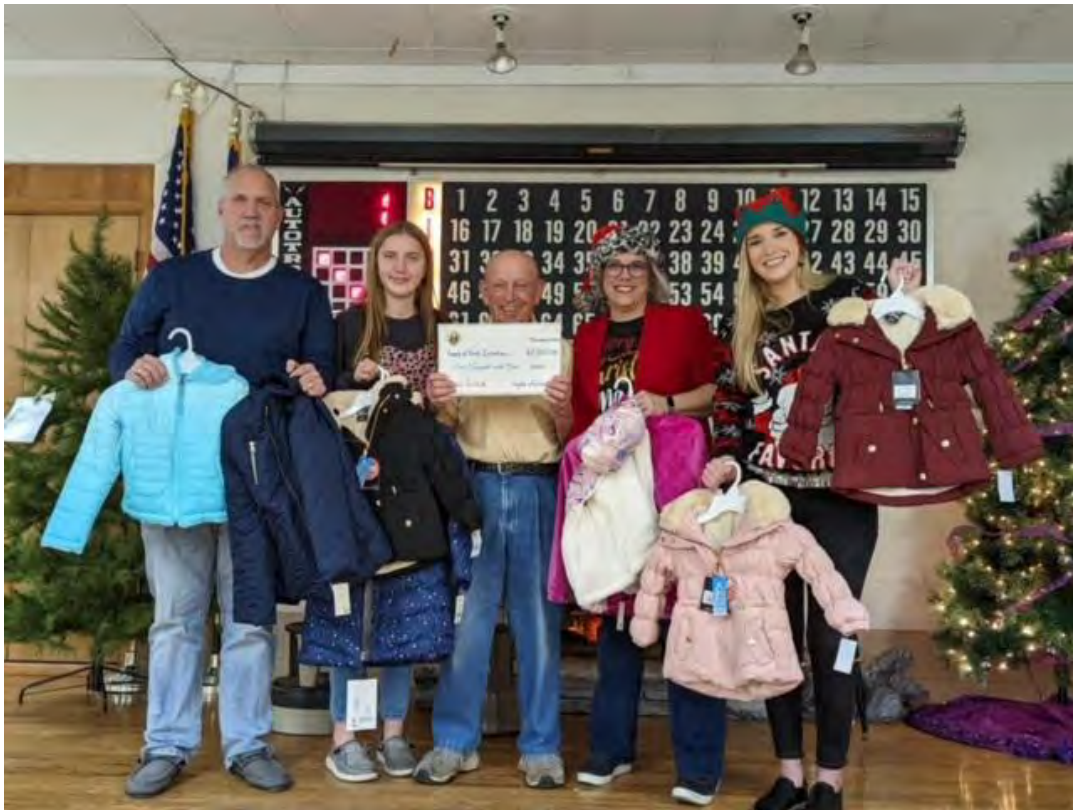
Coats for Kids Presentation Ceremony at Family & Youth Initiatives Center