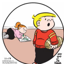
11-17 ©2008 by the Knights of Columbus www.knights.org "Dolly keeps humming 'Santa Claus is Comin' to Town' and we haven't even had Thanksgiving yet!"

Check out the new and improved Supreme web site at koc.org